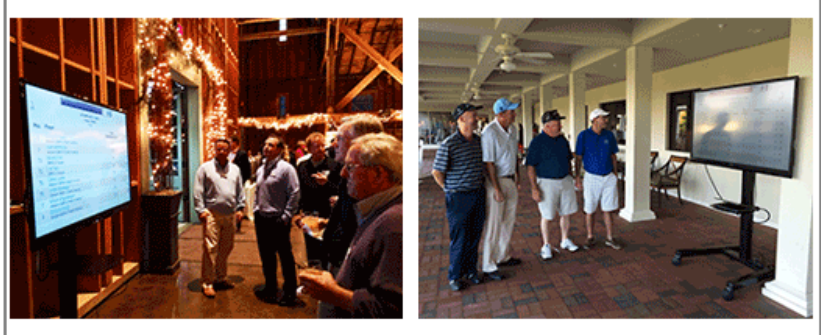
Players, families and friends can enjoy the Live Leaderboards from anywhere!

The registration process makes checking in, the day of your event, even easier for golfers than traditional tee sheets and spreadsheets.